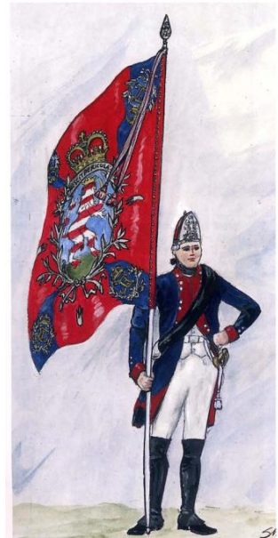
Figure 1 “Leibfahne of Regiment Erbprinz. As noted in text, it is not entirely clear whether small crowns and cyphers were always gold or followed the color of the uniform metal. It seems reasonable that the spear point would be silver or gold to match the regimental metal in buttons and cap plate.

In the American Revolution, the Hessians were a professional band of German auxiliaries who arrived to quash the rebellion. They were leased out from their home region of Hesse-Kassel—now part of modern Germany—and used by Britain to augment their small standing army. In 1776, 18,000 Hessian troops were sent to Staten Island . During the war, 5,000 were killed or injured, and 3,000 stayed in the United States after the war's end. Because of their circumstances as being rented by Britain, the Hessians were viewed as violent mercenaries who were willing to fight for the highest bidder.